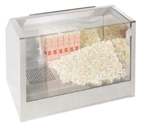
48" Counter Showcase Cornditioner