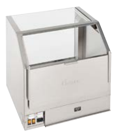
36" Counter Showcase Cornditioner